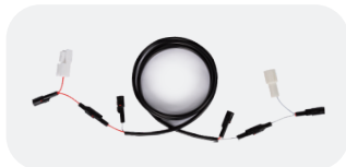
Double fog double reverse connection cable x1