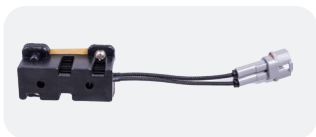
Electric resistance x2