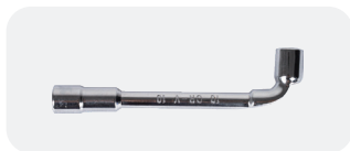
10mm Pipe sleeve x1